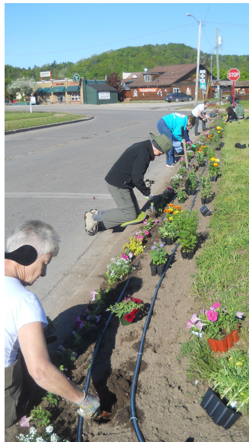
Planting flowers at "triangle" intersection, M-28, Munising

Participation in Alger County: 307 PreK-5th Grade students receive Social Emotional Learning 40 Min/Week: Mather Elementary, Munising, MI