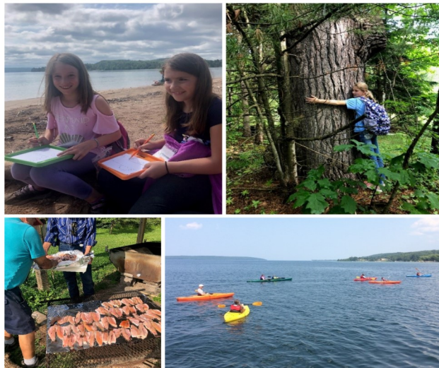
Above: Top Row L-R. Creating water color paintings with Lake Superior Water. Exploring old growth hemlock and white pine.

As part of the outdoor and environmental education opportunities offered to Alger County youth, the Summer 2019 Life of Lake Superior series was a big success, with 175 youth participants . Each day had a theme based around outdoor activities, including topics such as invasive species, historic pioneer days, forestry and forest health, and the nature of sound. During the pioneer history day, everyone got a chance to try horseback riding and go on a wagon ride. This day also included fishing, where the kids learned how to clean the fish they caught, which then became the evening's dinner.